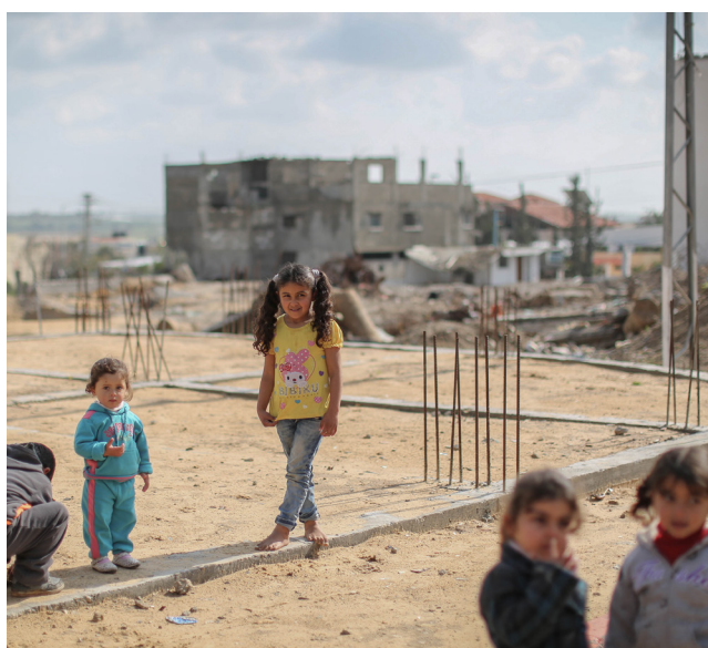
The former site of the Al Wafa Hospital. Most of the rubble has been cleared and nothing remains of the hospital (February 2016)

For safety reasons we cannot rebuild in the same location. This is the second time the hospital has been targeted. We are not going to risk a third time. Human life is too precious. There is no safe space in Gaza. We are now based in the city centre and far away from the border so there should be less military activity. But there is no guarantee. Even for the old building we had Israeli approval before we built it."